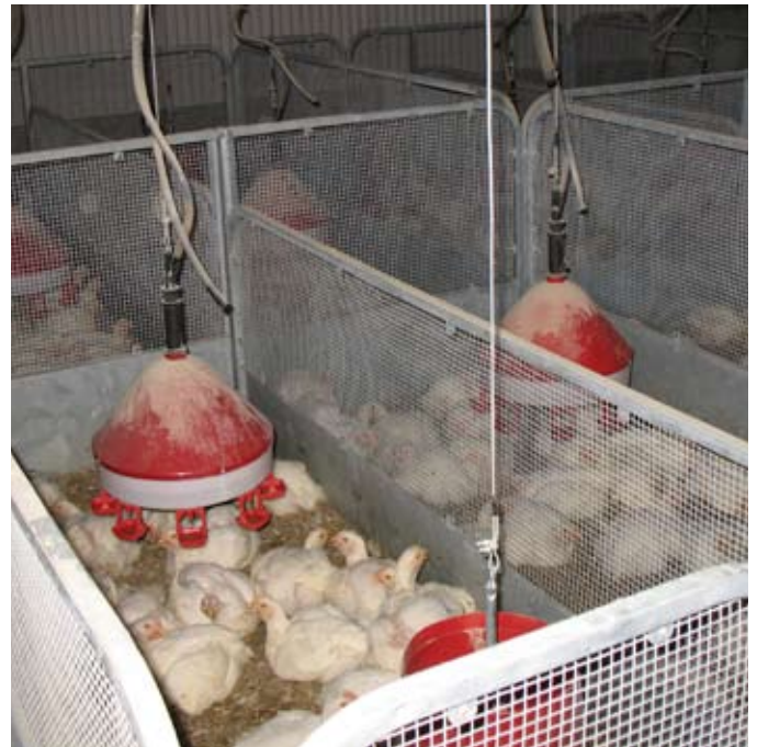
CRF's broiler research facilities in St. Jean Baptiste, Quebec

When minerals are dissolved in water, it becomes able to conduct electricity. By measuring this conductivity, you can calculate the total amount of dissolved solids. This measurement can be expressed in parts per million (ppm) of dissolved solids as a means of measuring water quality.